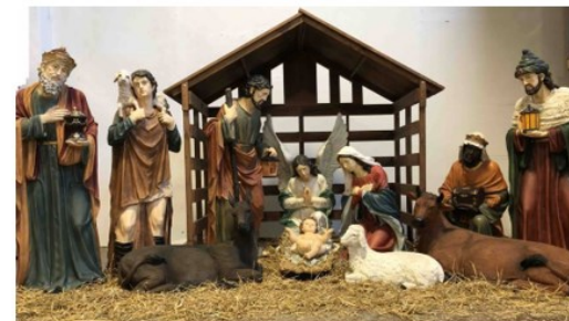
59 Inch Heavens Majesty 12pc Large Outdoor Nativity Set