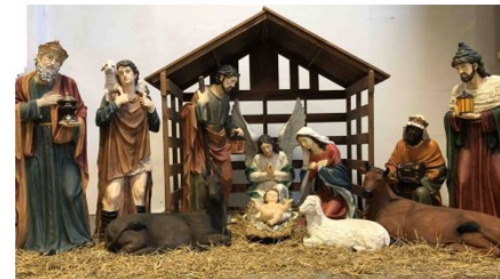
59 Inch Heavens Majesty 12pc Large Outdoor Nativity Set

Proceeds to go towards a new nativity set